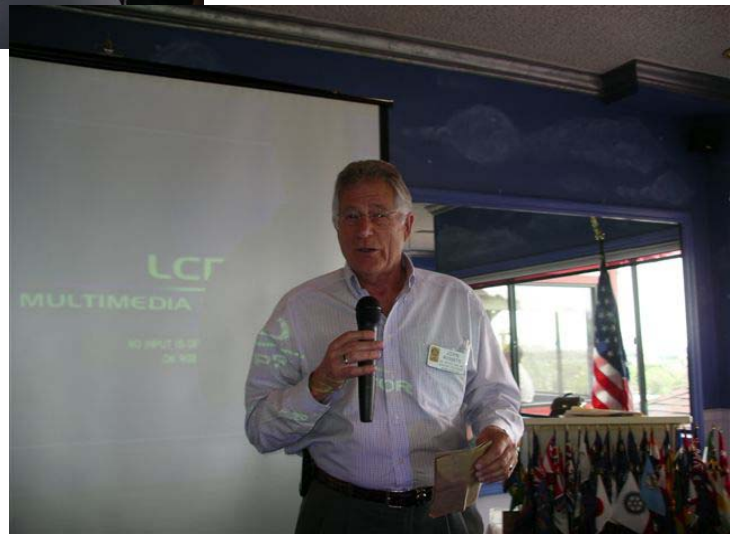
"Italian of the Month"

May the best day in your past be the worst day of your future