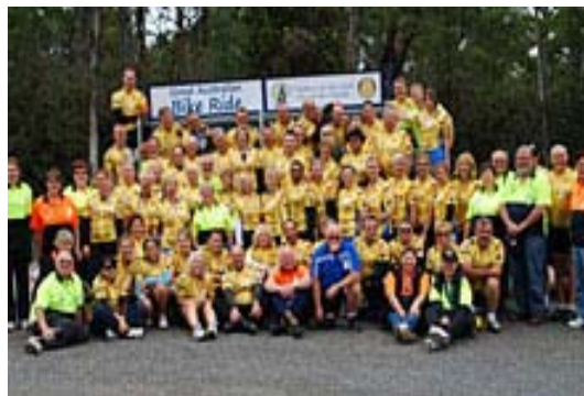
Riders and support crew for the first stage of the Great Australian Bike Ride take a group photo in Tasmania.

Australian Rotarians have embarked on the longest organized bike ride in their nation's history: a seven-month, 18,000-kilometer (11,200-mile) journey to raise awareness of Rotary, Australian Rotary Health, and the need to fund mental illness research.