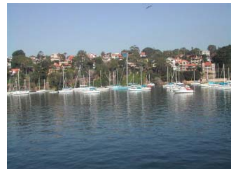
Typical of communities that line the foreshores. Two cars in the garage and a boat in the water