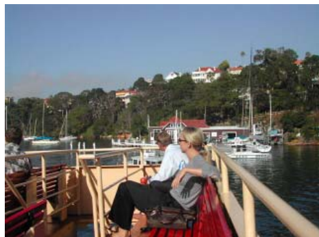
How about commuting this way, sure beats the Bayshore Freeway