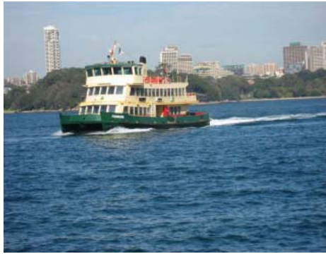
One of the many Ferries that ply the Sydney Harbor waters and a very popular way to commute