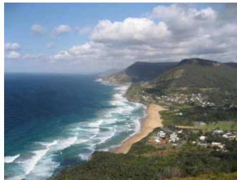
South of Sydney the incredible beauty of Stanwell Park and its small community