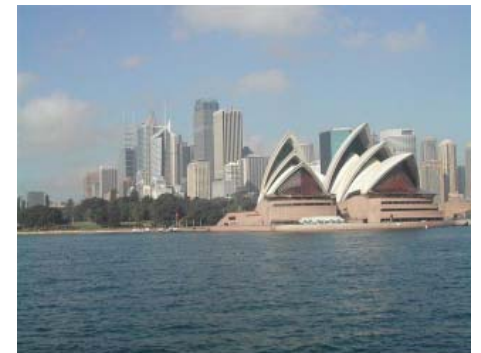
Perhaps one of the most photographed views of the Opera House and downtown Sydney