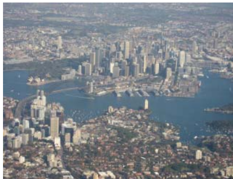
Aerial view of Sydney and the Opera House middle left and North Sydney connected to Sydney by the Sydney Harbor Bridge