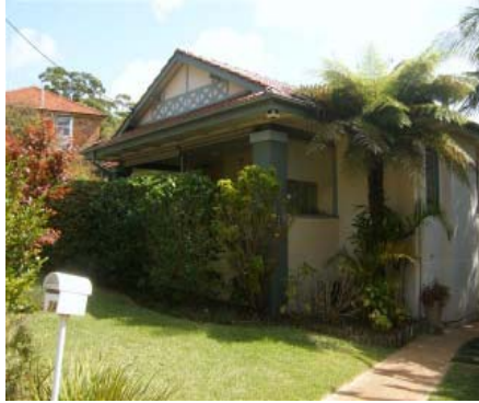
Don't laugh, even Abe Lincoln's birthplace is a tourist attraction. Now this place has not yet made the National Register, but someday?

The living is great here in Oz, perhaps the world's best beaches all up and down the east coast. Very high standard of living, housing like everywhere else is expensive in the desirable areas. I lived the first 12 or so years of my life in the Sydney suburb of Artarmon about 10 miles north of Sydney. It was an average working class area, modest homes in fact the one shown here was where I was born and raised. My family rented it