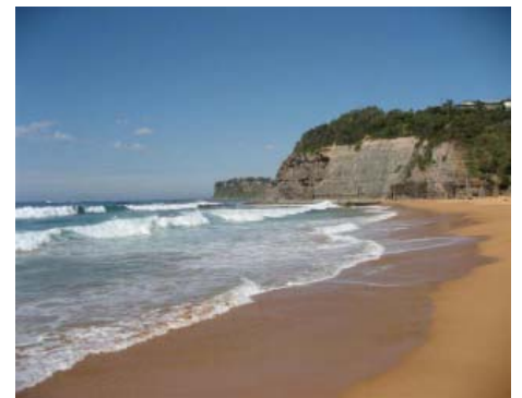
A typical Sydney beach, nice clean golden sand, water very safe for swimming except for the occasional shark. Temperature around 72 to 75 degrees. Always a good surf

lic transportation is excellent with Bus, Trains and Ferries and everything is coordinated. For instance when I arrive at Sydney Airport I go down the escalator to the station, take the train (which run at about 10 minute intervals, to Circular Quay the Ferry Terminal. Perhaps a two hundred yard walk to a Ferry system that goes all over the harbor to well over 100 or so "destinations". When you arrive at your "stop", there is a bus waiting that four or so minutes prior had just arrived with passengers who would get on the ferry you got off. There is no place that you cannot go to or get from that is not served by this system. San Francisco would do well to take note.