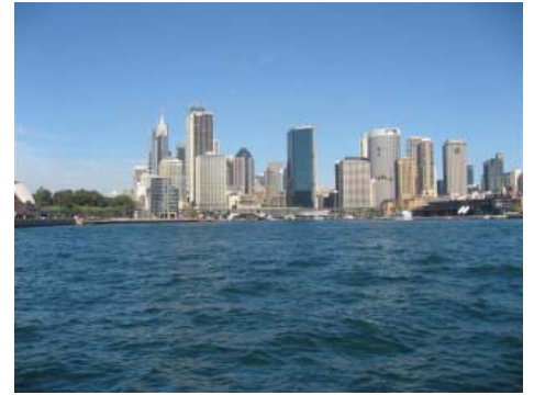
A view of downtown Sydney as you pull into Circular Quay Harbor Ferry Terminal