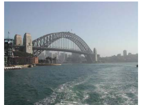
Sydney’s famous Harbor Bridge affectionately known as “The Coathanger” built in 1932 is the largest single span steel arch bridge in the world