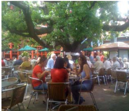
Beer Garden of "The Oaks" at Neutral Bay, typical weekday lunch time crowd. Then if you want "crowd" try it on a weekend

somewhere to eat. Most Pubs serve food in the Beer Garden and yesterday I had lunch at a very well know Pub called The Oaks, located in Neutral Bay.